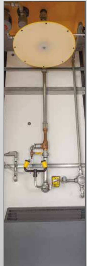
Quality parts, superior construction.