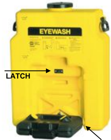
NORMAL OPERATING POSITION VIEW