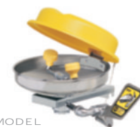
MODEL 01045001PBC Wall-mounted Eyewash with Strainer