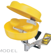
MODEL 01035511PBC Wall-mounted Eye/Facewash with Strainer