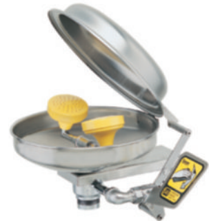
MODEL 01045501SBC Wall-mounted Facewash